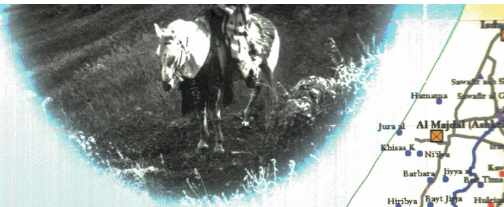
A Palestinian Village, 1890